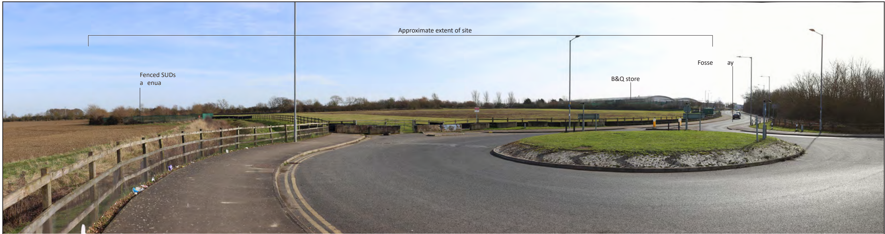
Viewpoint 3 - View southeast from Fosse way