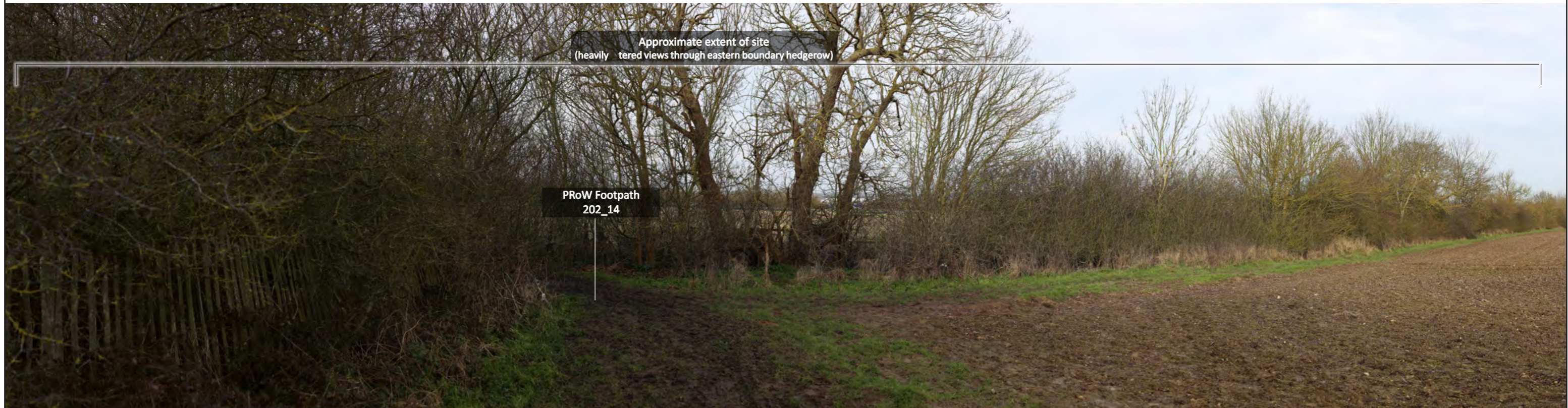
Viewpoint 4 - View west from PRoW Footpath 202_14 beyond the eastern boundary of the site